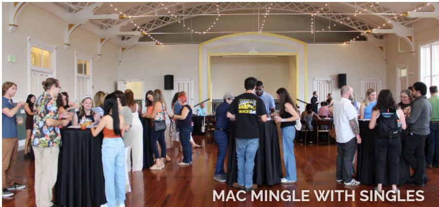
MAC MINGLE WITH SINGLES