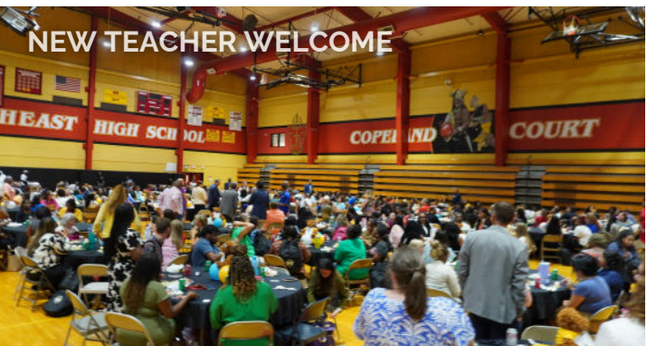
NEW TEACHER WELCOME