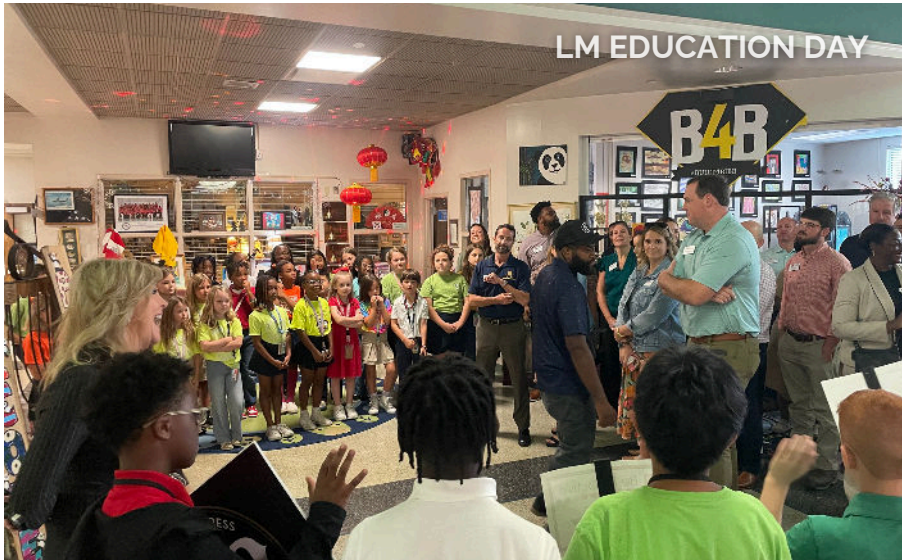
LM EDUCATION DAY