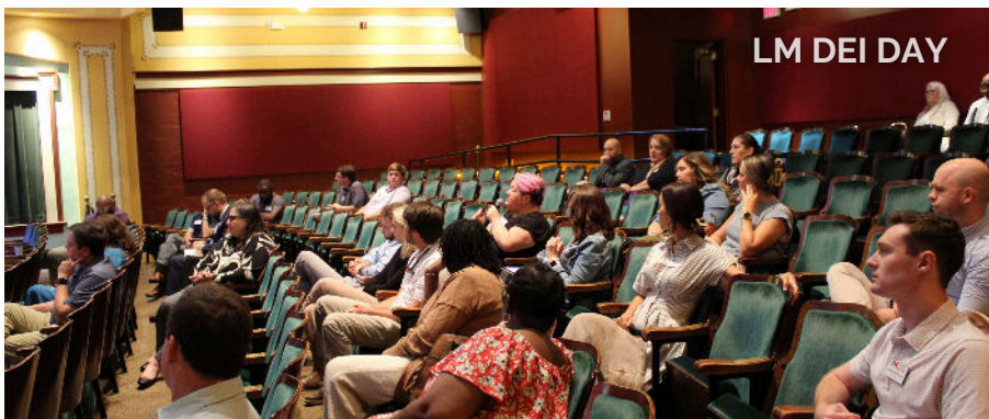
LM DEI DAY