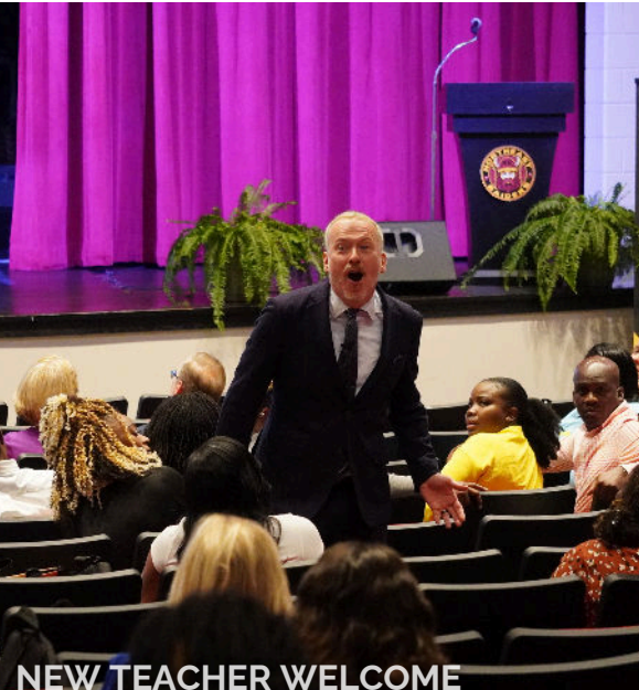
NEW TEACHER WELCOME