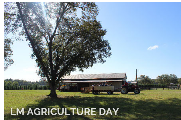
LM AGRICULTURE DAY